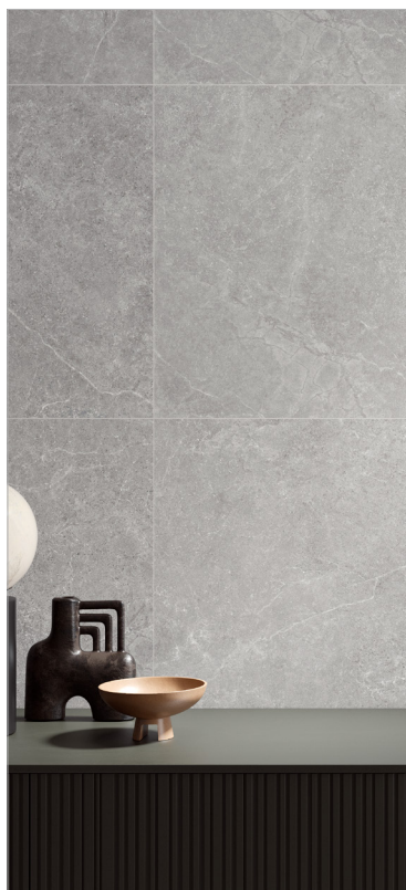
EDEN BIANCO MATT